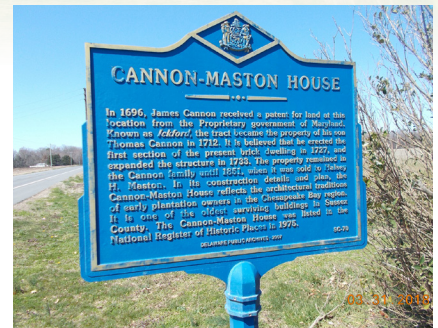
HISTORICAL MARKER SIGNAGE

Development progress on Ickford Park continues to move forward on both the Cannon-Maston House built in 1727 and the Williams Litchford farmhouse built in 1912 situated on the 59 acre property located northwest of Seaford on Atlanta Road. The property was acquired by the Trust in partnership with Sussex County for the purpose of protecting and preserving the Cannon-Maston House, one of the oldest structures in Sussex County. The Williams Litchford farmhouse was recently relocated to the western side of the property to preserve the viewshed of the historic Cannon-Maston House. Renovations to the Williams Litchford farmhouse are ongoing and a Certificate of Occupancy is expected in early 2024.