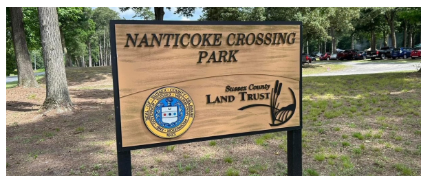
NANTICOKE CROSSING PARK SIGNAGE