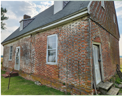
EXTERIOR FAÇADE OF CANNON-MASTON HOUSE