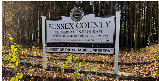
FOREST OF THE BROADKILL SIGNAGE

the Trust to maintain, operate and manage the property on behalf of the County. The property currently features several walking trails and will be accessible to the public in the future. The Trust is currently focused on enhancing the trail system and designing a small parking lot for public use. The property has been named Forest of the Broadkill and will be an incredible public amenity for area residents to enjoy.