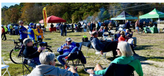
HUDSON PARK GRAND OPENING

The Board of Trustees and its partners have started the design for the second phase of the park improvements which will begin in 2024 and include additional parking and an onsite perimeter trail around the property. Phase 3 will include the Can-Do Playground, pavilion, public restrooms, shade structures and the conversion of the existing farm field into a pollinator meadow. What started as a conceptual idea for a public recreation amenity has become a reality over the course of a ten -year period. Good things take time.