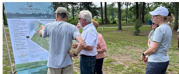
MEMBERS OF THE PUBLIC REVIEWING MASTERPLAN

A grand opening was hosted this past June, welcoming members of the public to celebrate this new river front park. At the event, Vernacular Landscape Architecture unveiled the concept plan for the Trust's long-term vision for the property and members of the public and neighbors were able to ask questions and provide input. The Trust will continue working with the team at Vernacular to finalize the plan and solicit construction estimates for the first phase of the project in 2024.