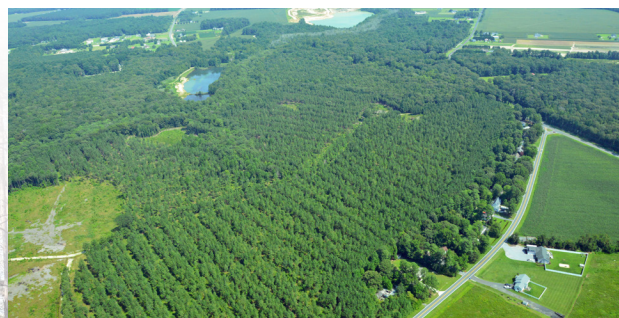
AERIAL VIEW LOOKING NORTHEAST